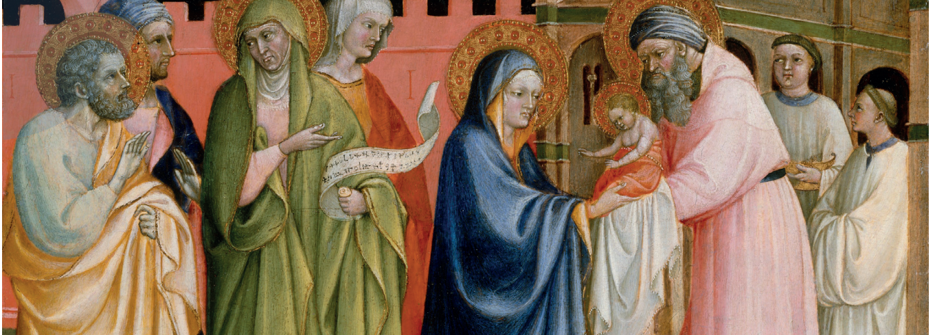
The Presentation in the Temple, Alvaro Pérez Portuguese, The Met Museum

“We too are called to welcome Jesus who comes to meet us. To encounter him: the God of life is to be encountered every day of our lives; not now and then, but every day. To follow Jesus is not a decision taken once and for all, it is a daily choice.” —Pope Francis, Feast of the Presentation of the Lord, 2019