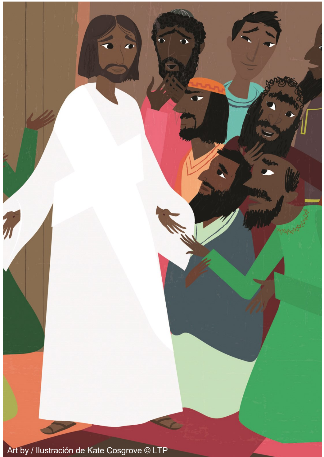
Art by / Ilustración de Kate Cosgrove © LTP